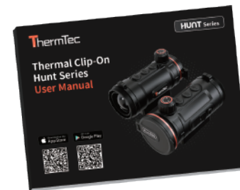
User manual (x1)